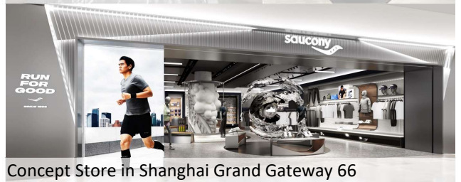
Concept Store in Shanghai Grand Gateway 66